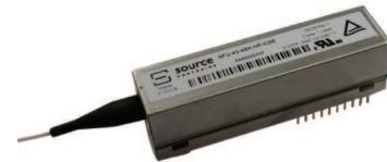
SFF GPON OLT

Source Photonics is a leading provider of fiber optic components used in telecommunication systems and data communication networks. Source designs, manufactures, and sells a broad portfolio of optical communication products, including passive optical network, or PON, subsystems, optical transceivers used in the enterprise, access, and metropolitan segments of the market, as well as other optical components, modules, and subsystems. In particular, Source products include optical subsystems used in fiber-to-the-premise, or FTTP, deployments which many telecommunication service providers are using to deliver video, voice, and data services.