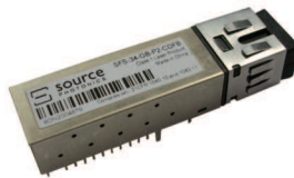
SFF GEPON ONU